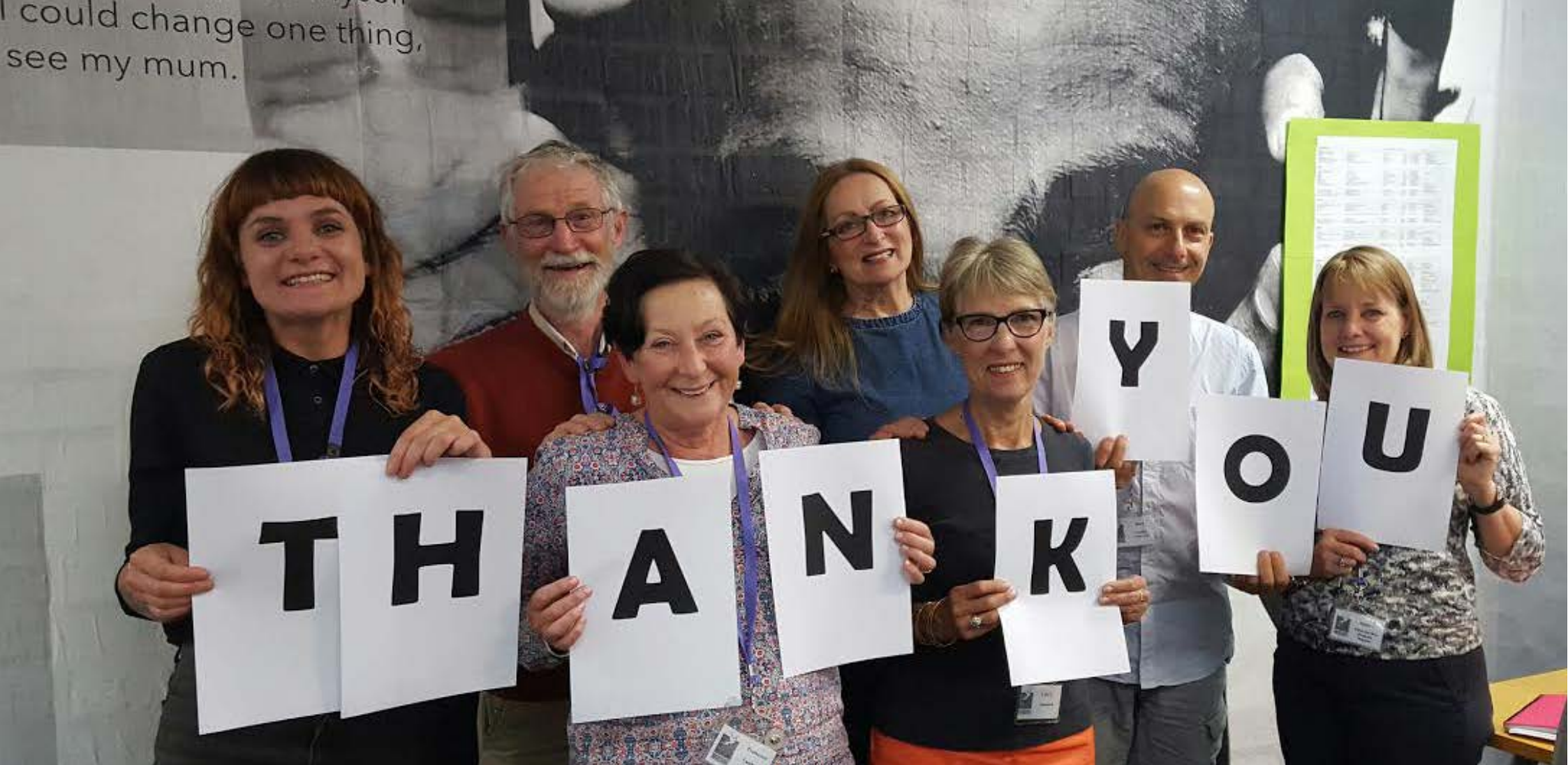
The Asylum Seekers Resource Centre Housing team, recipients of a Lead Project Grant Nov 2016